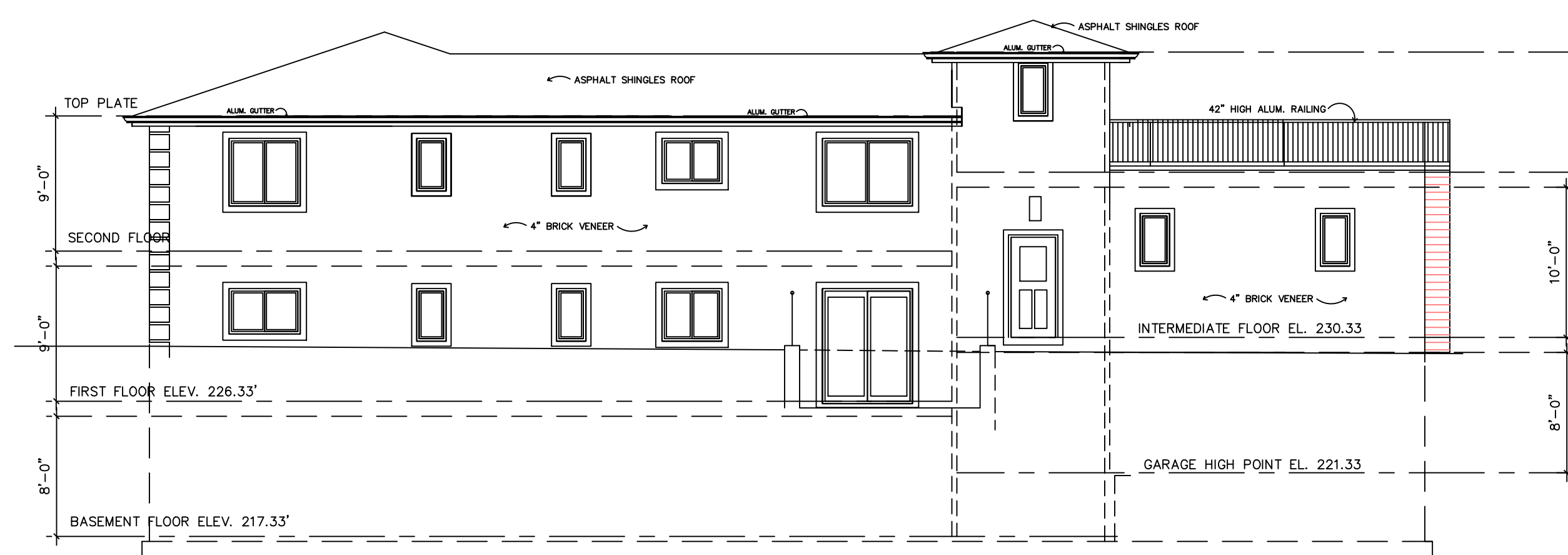
REAR ELEVATION SCALE: 1/8" = 1'-0"